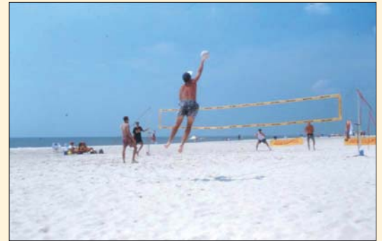
Outdoor recreation is at its best on the Mississippi Gulf Coast. The Gulf of Mexico provides the perfect setting for volleyball, jetskiing, windsurfing, parasailing, sailing, bodysurfing or simply lounging by the surf.