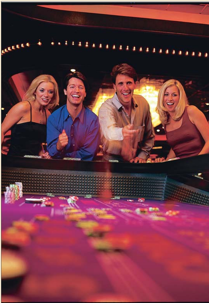
The Mississippi Gulf Coast is now the third largest pleasure destination with gaming in the United States. Whether you're visiting the casino scene for a pull at the slots or to see a special show, the surroundings will amaze you. From foot stompin' fun to glamour and glitz, the Coast casinos are here to entertain you.