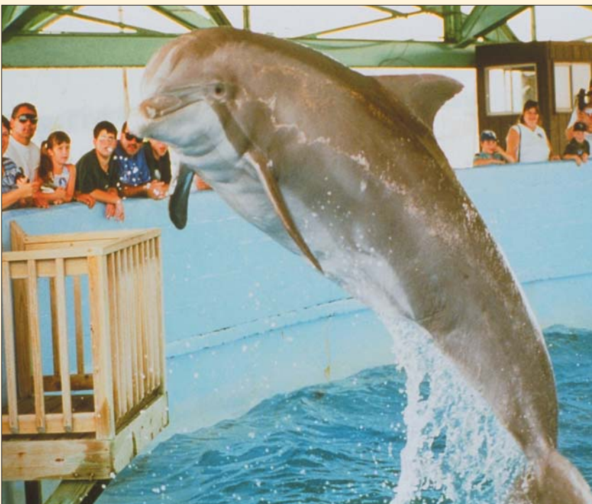
Come explore the fascinating world of the bottlenose dolphin, loggerhead turtle and the California sea lion at the Marine Life Oceanarium featuring exciting sea life from the Gulf of Mexico