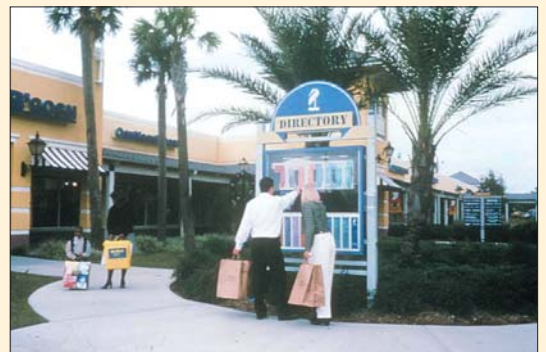
The Prime Outlets feature more than 80 brand name shops but it's just one of many great shopping destinations. Visit Crossroads Mall, Edgewater Mall, or one of the many specialty boutiques along the Coast.