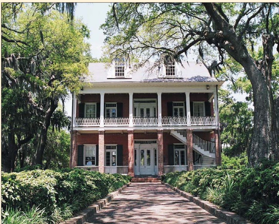
The Tull House