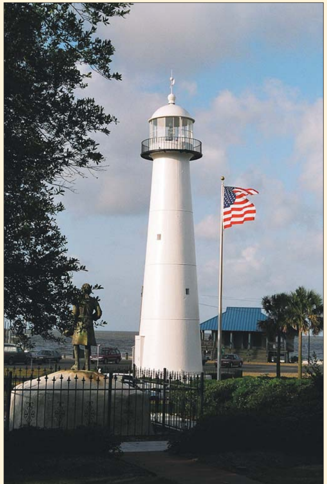
Since 1848 the Biloxi Lighthouse has guided seafarers and fisherman to safe harbor. Now located in the middle of a four-lane highway, the lighthouse remains lit and is open for tours daily.

"It's really a unique old ballpark. There is lots of shaded area; in fact the batting cage is really shaded. We have an area with four fields and you can walk along the sidewalk and go over a creek to two other fields right next