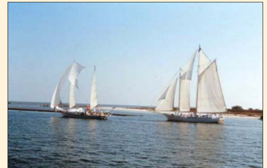
One of two schooners historically replicated after the great "white winged" boats that once harvested the world's seafood supply along Mississippi's Gulf Coast.