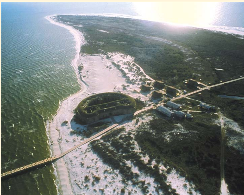
Part of Gulf Islands National Seashore, Ship Island features crystal clear gulf water, secluded stretches of natural beach and Ft. Massachusetts, a pre-civil war fort once used as a P.O.W. camp during the civil war.