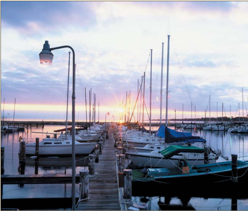
With more than 200 varieties of fish at home in the Gulf of Mexico, Mississippi's Gulf Coast is regarded as one of the world's top twenty saltwater fishing destinations.