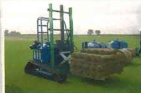
TM400 with 88" Scissor Forks