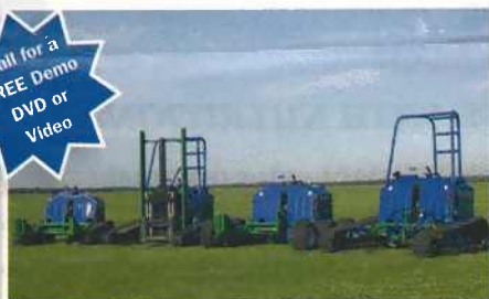
NEW FOR 2005 TRAXMAX 250