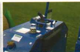
Hydraulic Joystick - no cable to adjust