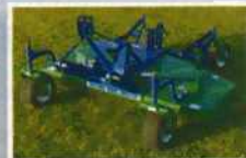
Mathis SD 75 Finishing Mower