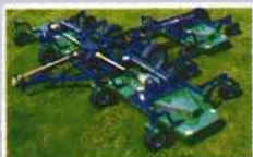
Mathis TD 215 Finishing Mower