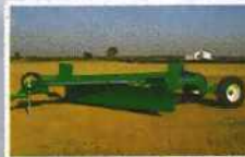
GraderMax 80 Grader/Box Blade