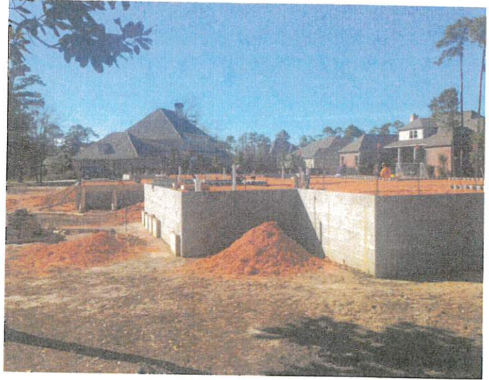
Right Side view of Hyde residence under construction 1/29/15, looking West, Lots 51 & 52, Waterside Subd., City of Gulfport, MS.