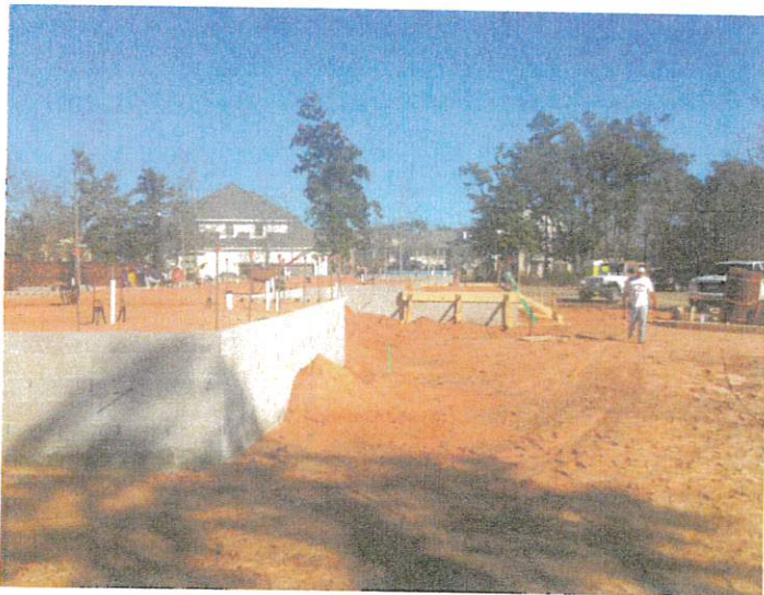
Left Side view of Hyde residence under construction 1/29/15, looking East, Lots 51 & 52, Waterside Subd., City of Gulfport, MS.