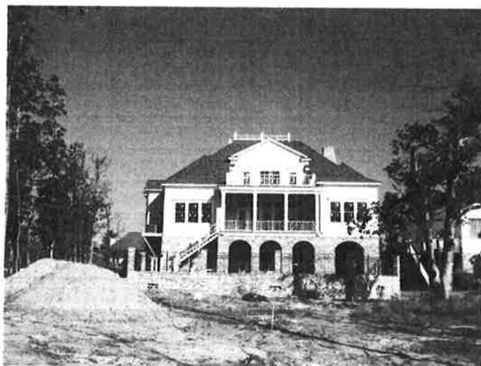
Rear View 1/17/2011