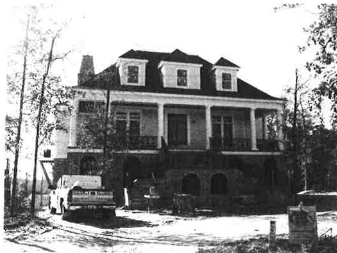
Front View 1/17/2011

If using the Elevation Certificate to obtain NFIP flood insurance, affix at least two building photographs below according to the instructions for Item A6. Identify all photographs with: date taken; "Front View" and "Rear View"; and, if required, "Right Side View" and "Left Side View." If submitting more photographs than will fit on this page, use the Continuation Page on the reverse.