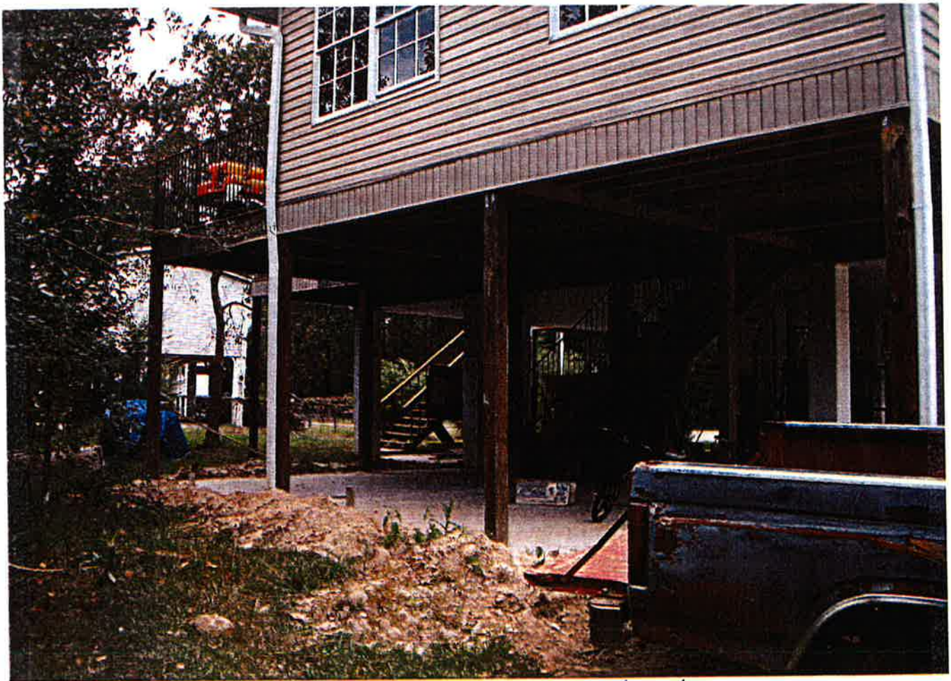
REAR VIEW 10/26/09

If submitting more photographs than will fit on the preceding page, affix the additional photographs below. Identify all photographs with: date taken; "Front View" and "Rear View"; and, if required, "Right Side View" and "Left Side View."