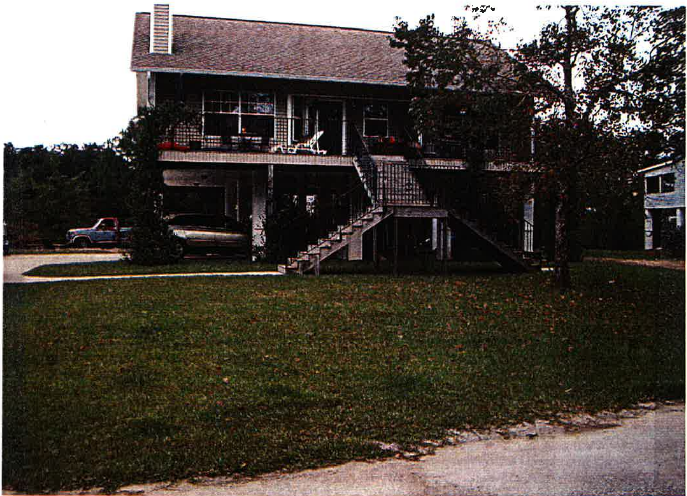
FRONT VIEW 10/26/09