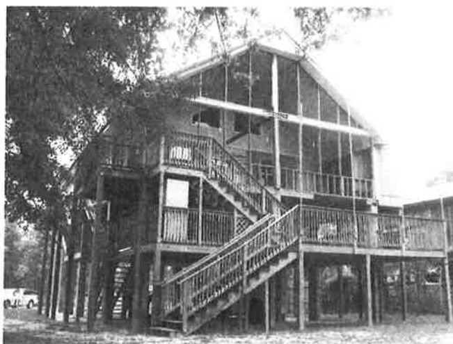
Rear View 5/13/2010