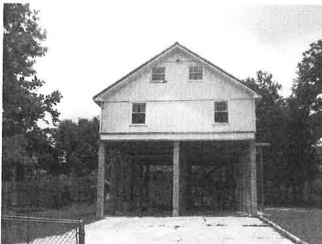
Front View 5/13/2010

If using the Elevation Certificate to obtain NFIP flood insurance, affix at least two building photographs below according to the instructions for Item A6. Identify all photographs with: date taken; "Front View" and "Rear View"; and, if required, "Right Side View" and "Left Side View." If submitting more photographs than will fit on this page, use the Continuation Page on the reverse.