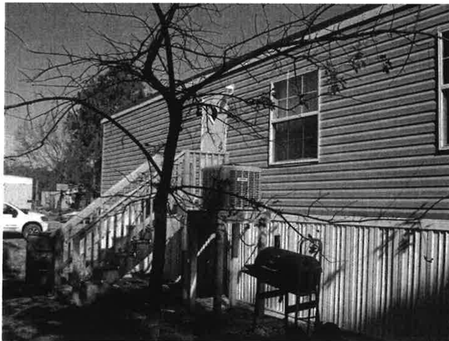
Rear View (01/07/14)