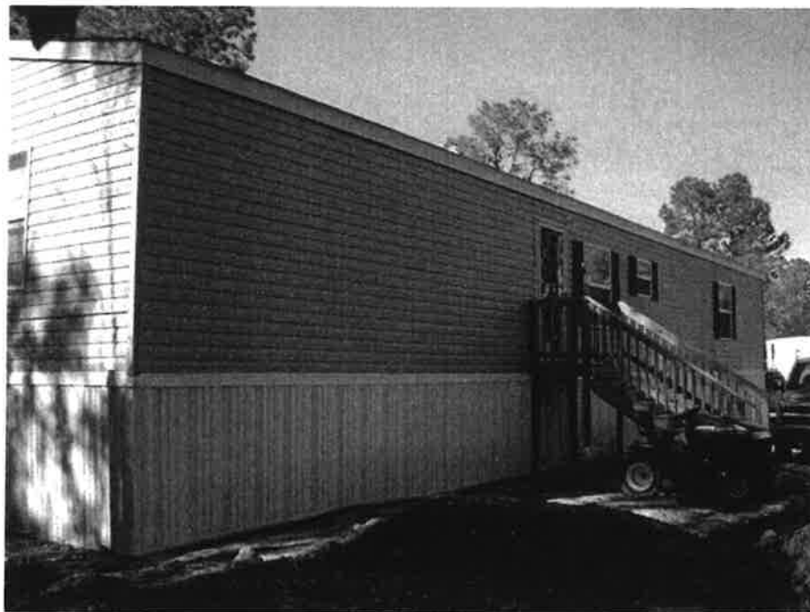
Front View (01/07/14)

If using the Elevation Certificate to obtain NFIP flood insurance, affix at least 2 building photographs below according to the instructions for Item A6. Identify all photographs with date taken; "Front View" and "Rear View"; and, if required, "Right Side View" and "Left Side View." When applicable, photographs must show the foundation with representative examples of the flood openings or vents, as indicated in Section A8. If submitting more photographs than will fit on this page, use the Continuation Page.