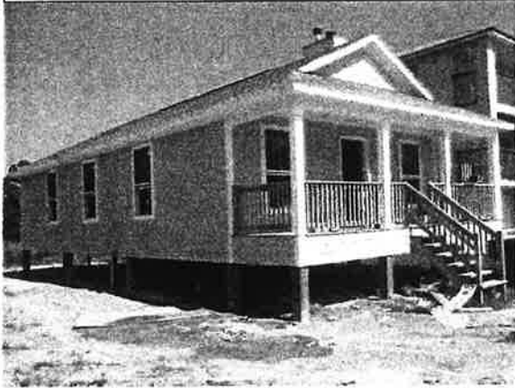
Northwest of the house looking Southeast.