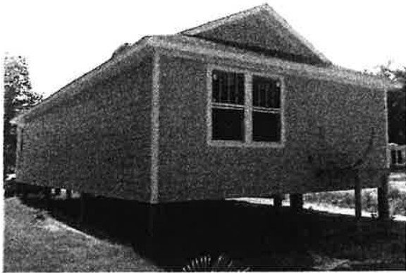
Southeast of the house looking Northwest.