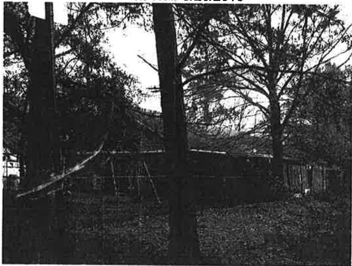
Rear View 3/26/2010