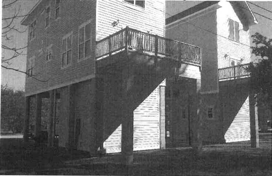
Facing southeast looking at northwest corner of building