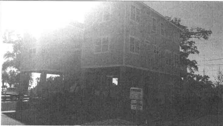
Facing southwest looking at northeast corner of building

If using the Elevation Certificate to obtain NFIP flood insurance, affix at least 2 building photographs below according to the instructions for Item A6. Identify all photographs with date taken; "Front View" and "Rear View"; and, if required, "Right Side View" and "Left Side View." When applicable, photographs must show the foundation with representative examples of the flood openings or vents, as indicated in Section A8. If submitting more photographs than will fit on this page, use the Continuation Page.