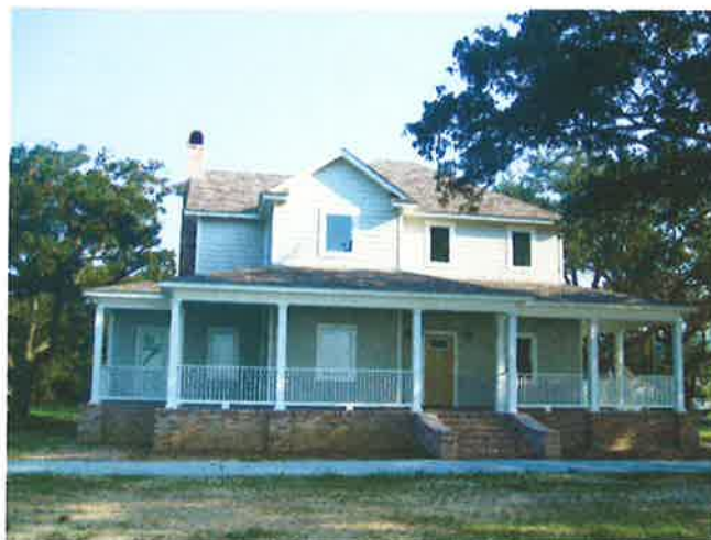
Front View 9/24/2012