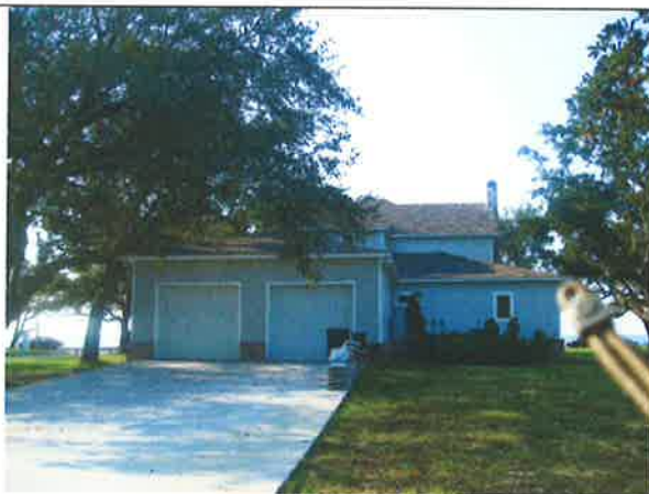
Rear View 9/24/2012

If using the Elevation Certificate to obtain NFIP flood insurance, affix at least two building photographs below according to the instructions for Item A6. Identify all photographs with: date taken; "Front View" and "Rear View"; and, if required, "Right Side View" and "Left Side View." If submitting more photographs than will fit on this page, use the Continuation Page on the reverse.