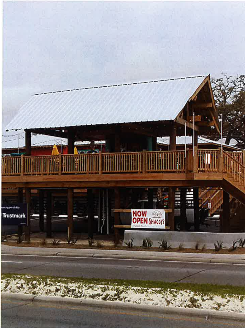
REAR VIEW 03/28/2016

If submitting more photographs than will fit on the preceding page, affix the additional photographs below. Identify all photographs with: date taken; "Front View" and "Rear View"; and, if required, "Right Side View" and "Left Side View." When applicable, photographs must show the foundation with representative examples of the flood openings or vents, as indicated in Section A8.