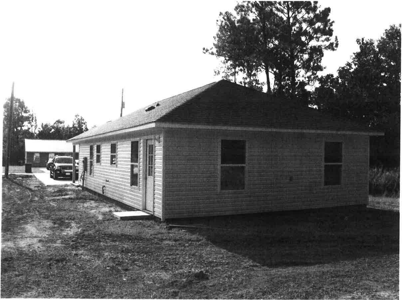
REAR VIEW – 02 AUGUST 2010