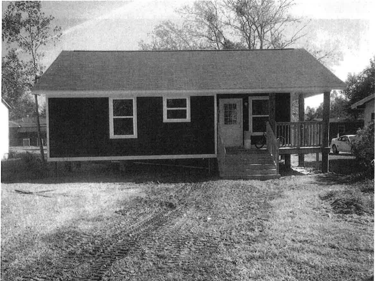
Rear view of house