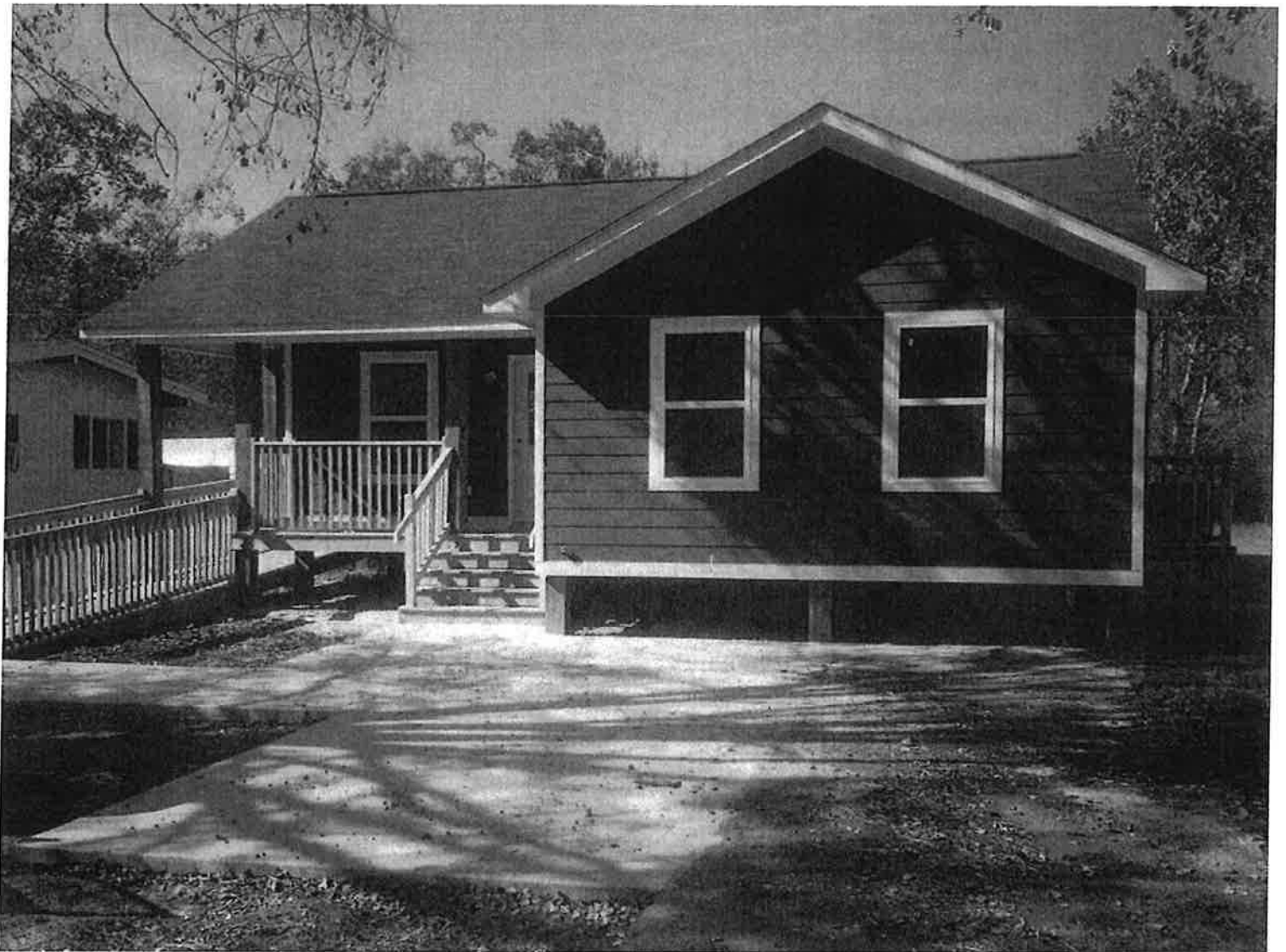
Front view of house