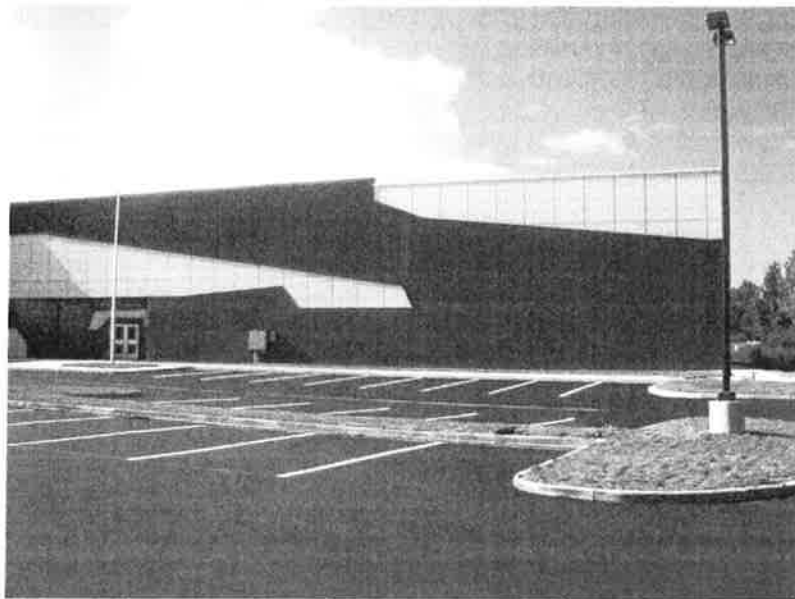
West End of Front View 09-10-10