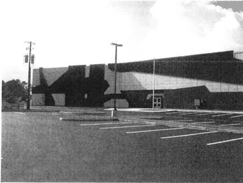
East End of Front View 09-10-10