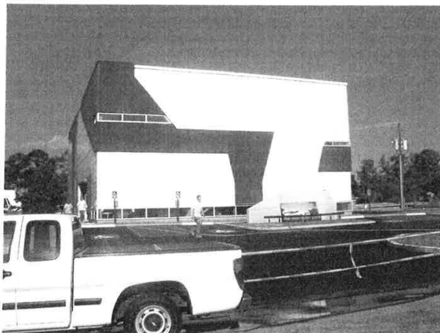
Left Side View Facing Holly Circle 09-10-10