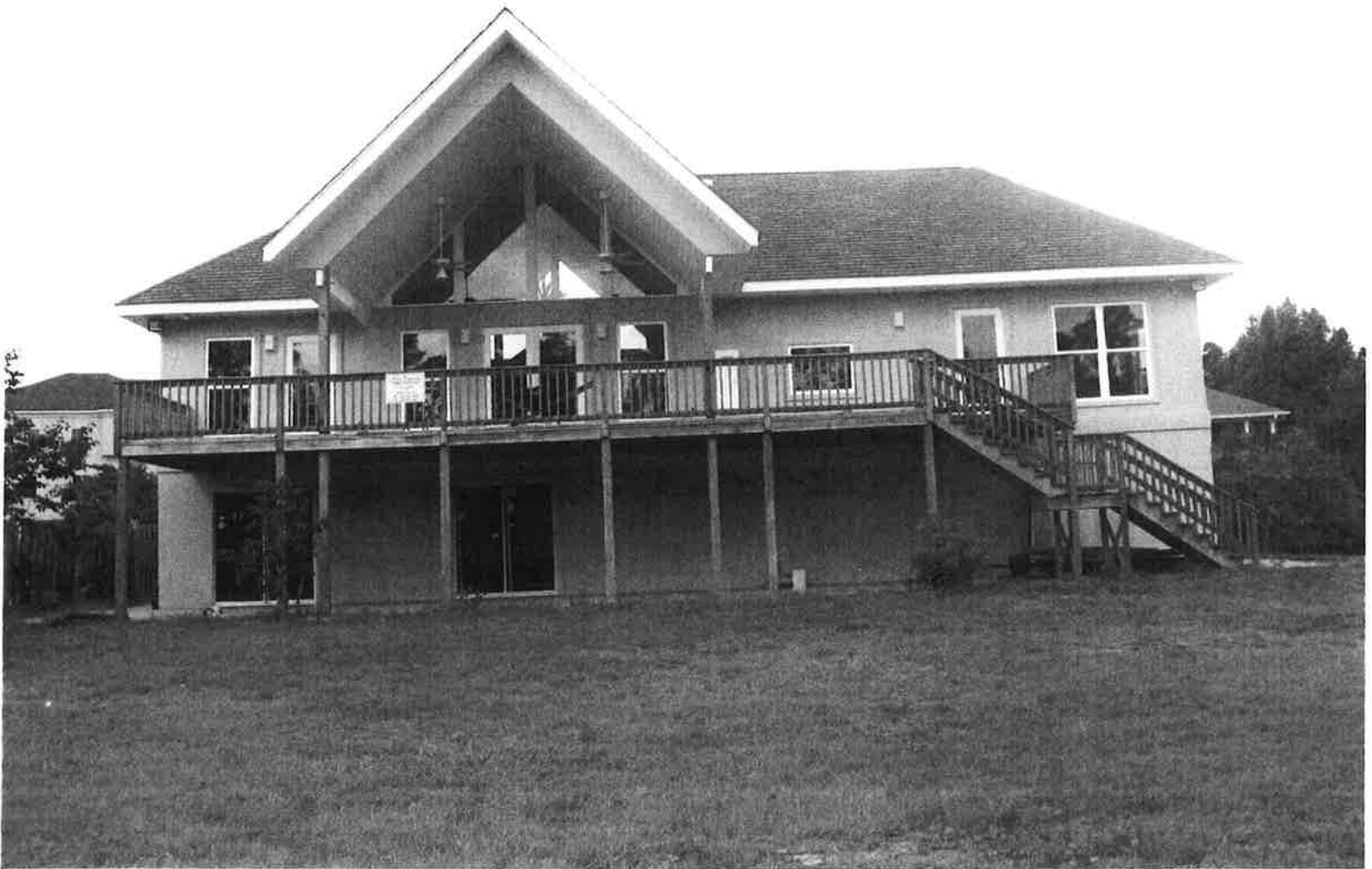
REAR VIEW -28 JUNE 2011