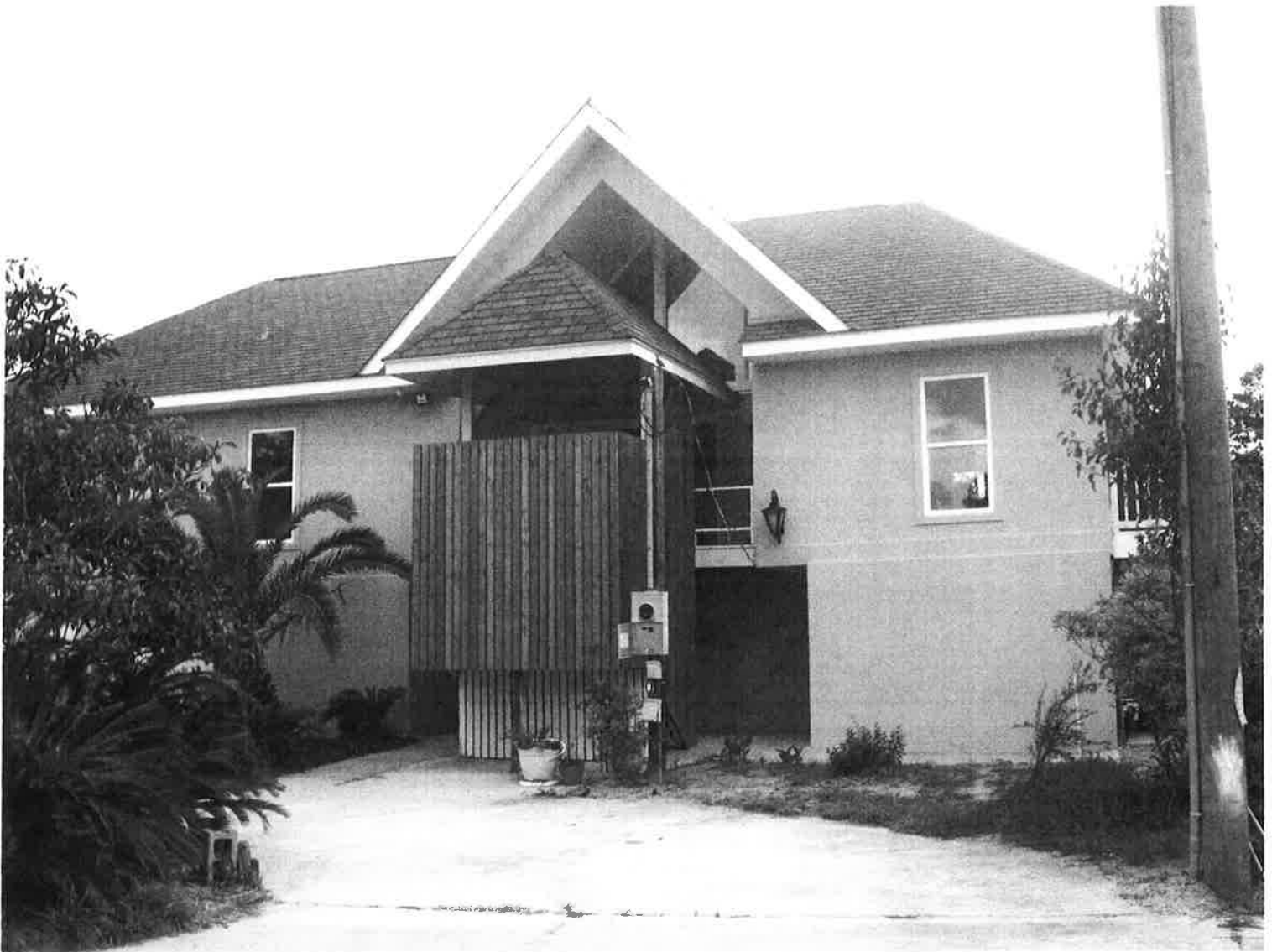
FRONT VIEW – 28 JUNE 2011

If using the Elevation Certificate to obtain NFIP flood insurance, affix at least two building photographs below according to the instructions for Item A6. Identify all photographs with: date taken; "Front View" and "Rear View"; and, if required, "Right Side View" and "Left Side View." If submitting more photographs than will fit on this page, use the Continuation Page on the reverse.