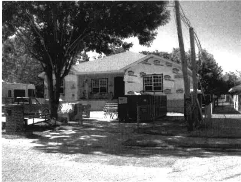
FRONT VIEW 07/17/13

If using the Elevation Certificate to obtain NFIP flood insurance, affix at least 2 building photographs below according to the instructions for Item A6. Identify all photographs with date taken; "Front View" and "Rear View"; and, if required, "Right Side View" and "Left Side View." When applicable, photographs must show the foundation with representative examples of the flood openings or vents, as indicated in Section A8. If submitting more photographs than will fit on this page, use the Continuation Page.