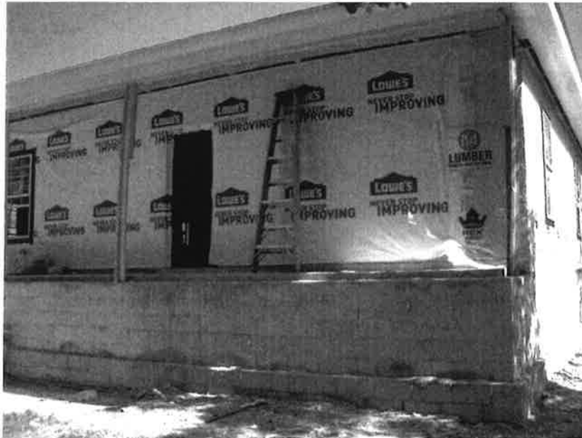
REAR VIEW (right side) 07/17/13

If submitting more photographs than will fit on the preceding page, affix the additional photographs below. Identify all photographs with: date taken; "Front View" and "Rear View"; and, if required, "Right Side View" and "Left Side View." When applicable, photographs must show the foundation with representative examples of the flood openings or vents, as indicated in Section A8.