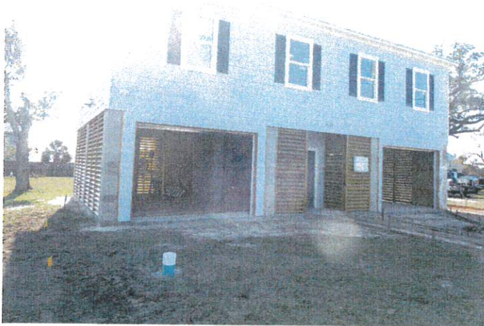
Rear View 12/20/16