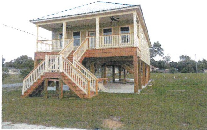
Rear View 10/13/15